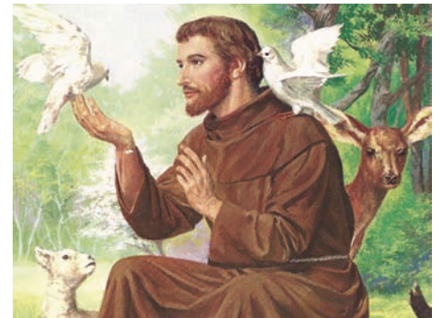
St. Francis and the Blessing of Animals